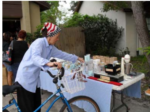
The Terraces Deer Run HOA 7A & 7B P. O. 516 Casselberry, FL 32718

After an extremely hot summer, but Saturday, October 15th was a cool clear day. Over 20 homeowners sold goodies from their garages, and your HOA had the signs up, the ad in the paper and it was a great success. Shall we do it again next year?????